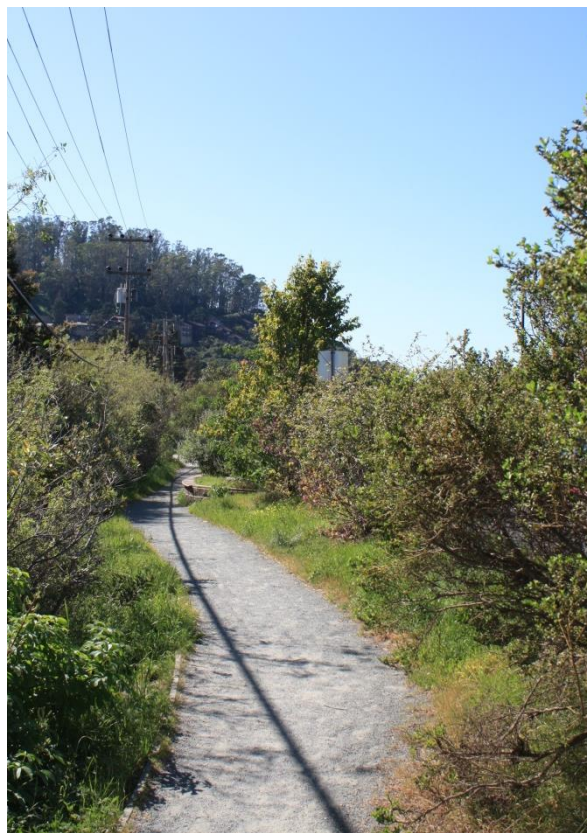
Cerrito Creek Trail

Other planned improvements include the extension of trails along Cerrito and Codornices Creeks. Opportunities for such trails exist west of San Pablo Avenue, where much of the land on the Albany side of the creek is already in public ownership. The planned senior housing development at University Village will include trail improvements along Codornices Creek, linking San Pablo Avenue to the existing trail further west. There is also a potential to improve the trail system along Cerrito Creek within Creekside Park, and to the east near El Cerrito Plaza. Opportunities for creekside trails are much more limited elsewhere along these creeks, since they are located in private backyards.