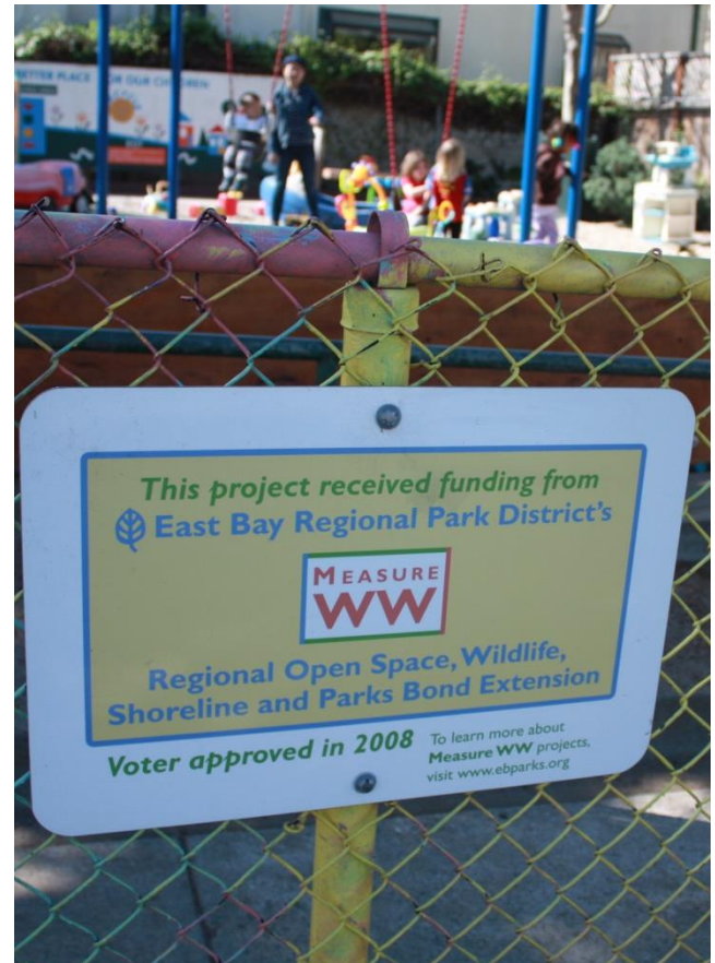
Dartmouth Mini Park

Work with Caltrans, Union Pacific Railroad, and other parties to explore enhancement of the underutilized open space along Interstate 80, particularly on the east side of the freeway at the Buchanan Street interchange. Use of this space for landscaping, gateway signage, public art, stormwater management, and similar improvements should be considered.