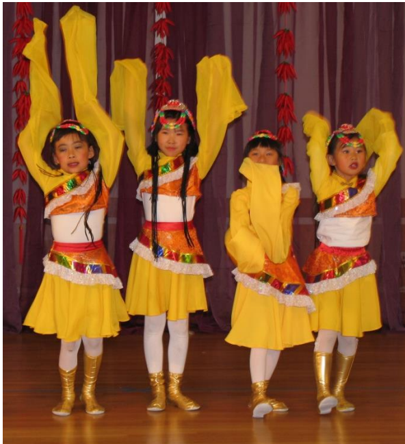
Chinese New Year tumbling performance

Renovate and maintain City sports fields and continue to collaborate with areawide sports field users on field programming and maintenance. Explore opportunities to create new sports fields, including fields on locations outside of Albany, through joint powers agreements, and joint efforts with field users. In addition, to increase the usefulness of athletic fields, encourage field designs and configurations that can accommodate multiple sports rather than one sport alone.