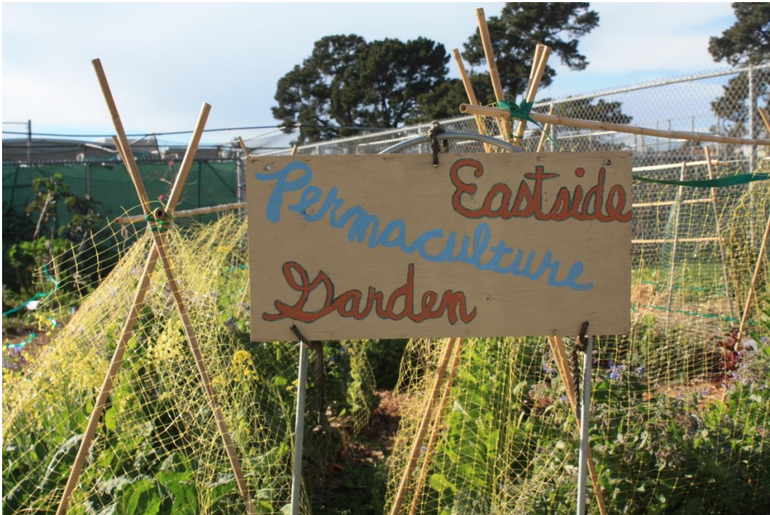
Eastside Permaculture Garden in Memorial Park

In addition to the open spaces described above, most residential properties in Albany include front yards, back yards, and side yards. Collectively, these spaces create a sense of spaciousness, provide access to sunlight, and support habitat for birds and other wildlife. Landscaped roadway medians, rights-of-way, and areas around public buildings also are part of the open space network. Streets themselves provide another form of open space and present opportunities for greening, stormwater management, community gatherings, and certain forms of active and passive recreation. Open spaces also may include rooftop gardens, urban plazas, schoolyards, courtyards, and other outdoor activity areas.