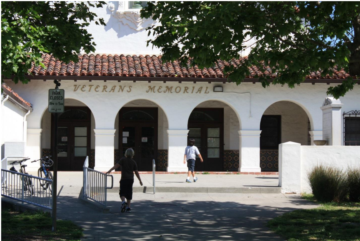
Veterans Memorial Building, Memorial Park