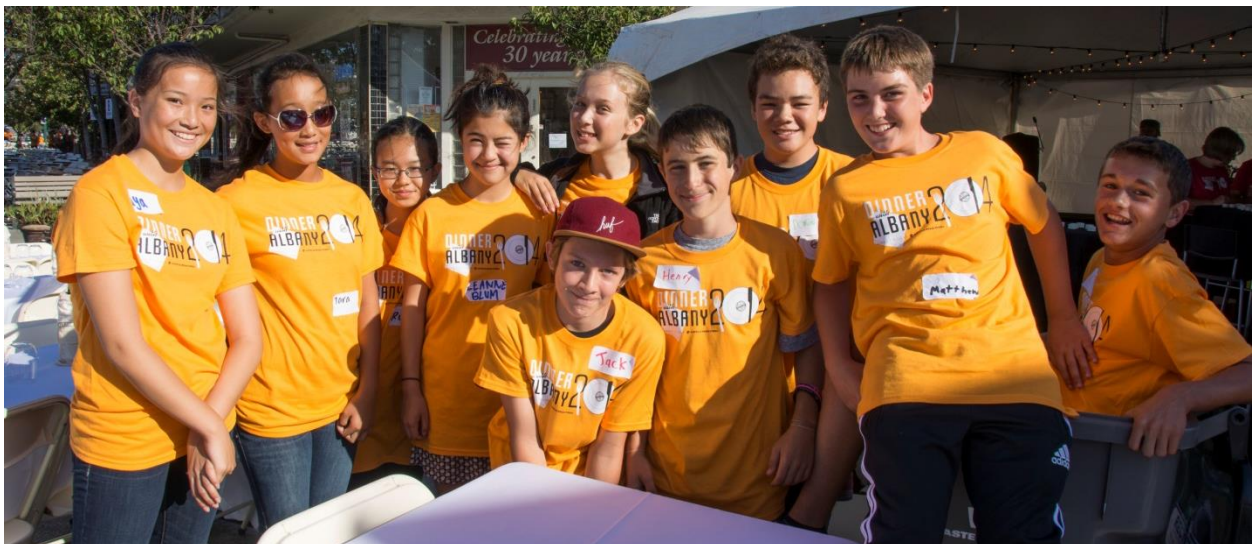
Teens prepare for Dinner with Albany, 2014

See policies under Goal 5 for references to the School District's role as a partner in the delivery of recreational services and programs.