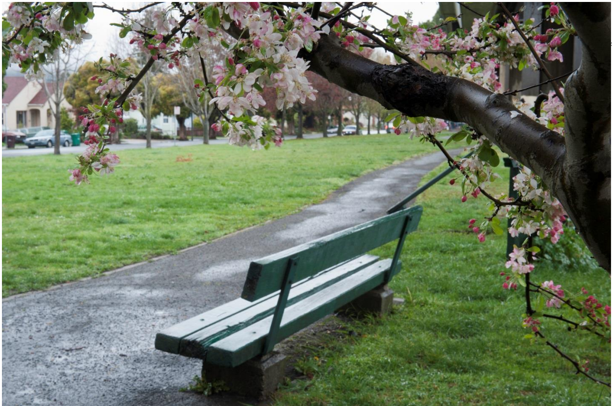
Ohlone Greenway near Codornices Creek

Per capita acreage standards are supplemented by distance standards (in other words, the distance a resident has to walk, bike, or drive to reach a park) and standards for specific types of facilities. The National Recreation and Park Association (NRPA) has a guideline that all residents should be within \frac{1}{2} mile of a neighborhood (or community) park. Some parts of Albany do not meet this standard, including the high-density areas along Pierce Street and the east side of Albany Hill. Construction of the new Pierce Street Park should address this deficiency.